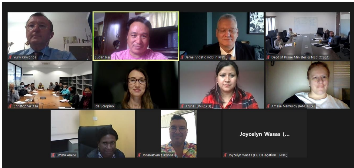
Figure 1: Group photo of UNRCPD staff, the EU delegation, experts and twenty-one national participants from various governmental agencies and civil society.

As travelling in the Asia-Pacific region remains challenging in the wake of the Covid-19 pandemic, the United Nations Regional Centre for Peace and Disarmament in Asia and the Pacific (UNRCPD) adapted a planned national training on gender and small arms control for government officials from Papua New Guinea into a webinar series. The four-part series, conducted in partnership with the Office of Prime Minister and National Executive Council (NEC) of Papua New Guinea, were held on 23, 24 and 30 September and 1 October.