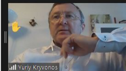
Figure 3: On the third day, participants joined in a brainstorming exercise on ways to improve the Firearms Act 1996 to prevent violence against women perpetrated with small arms.

(1) Subject to this section, the Registrar, on receipt of an application and the prescribed fee, may issue a firearm licence in respect of a firearm produced to him if he is satisfied that the firearm is owned by a person who— (a) is of or over the age of 18 years; and (b) has not been convicted of an offence against this Act and sentenced to a term of imprisonment; and (c) has not been convicted of an offence, otherwise than under this Act arising out of or in connection with his possession or use of a firearm and sentenced to a term of imprisonment; and (d) is a fit and proper person to own a firearm; and (e) can be reasonably permitted to have in his possession, to use and to carry the firearm without danger to the public safety or to the peace; and (f) has a substantial reason for requiring a firearm, and that the firearm is safe and fit for use.